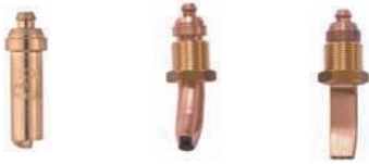
Art. 4425 Art. 4450 Art. 4451

Possible additions to the standard cutting attachment: