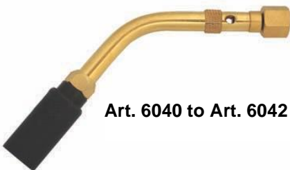
Art. 6040 to Art. 6042

Propane Heating Set II - including pressure regulator Art. 6201, torch handle with gas saving lever Art. 6001, torch tube Art. 6024, torch head Art. 6033 and 4 m propane hose, set completely assembled (similar applications to above, but with larger heating requirements) Art. 6181